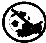
On reserved sites & pitches

Park Watch Partners: ... Every 'Friend' is a partner in helping to protect our unique urban parkland, by acting as the Council's eyes and ears. They will appreciate your assistance, as they cannot be everywhere at all times. Just telephone one of the numbers below, if you see something that needs their attention, (you may give your name or not— as you prefer).