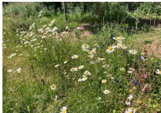
Right: Oxeye daisies and cornflowers