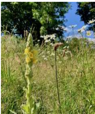
Left picture: Verbascum and oxeye daisies