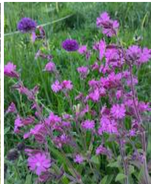
Middle: Red Campion