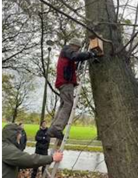
The first batch of 11 bird nesting boxes were taken down for routine cleaning, maintenance and data collection on 7 November. They will be going back up shortly and the remaining 10 attended to. This is part of the FoMBL biodiversity initiative. Please say hello if you see us in action. Keith Gifford