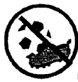
On reserved sites & pitches

P ark Watch Partners: ... Every 'Friend' is a partner in helping to protect our unique urban parkland, by acting as the Council's eyes and ears. They will appreciate your assistance, as they cannot be everywhere at all times. Just telephone one of the numbers below, if you see something that needs their attention, (you may give your name or not—as you prefer).