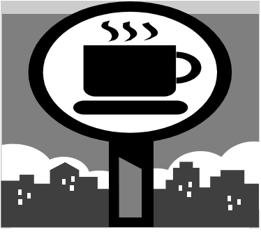
"A Nice Hot Cappuccino"

Q) What do you see the Friends group doing for the Meadows and Links area?